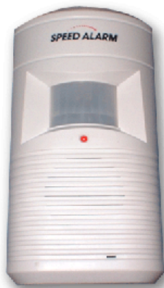
SA 2000 Main unit